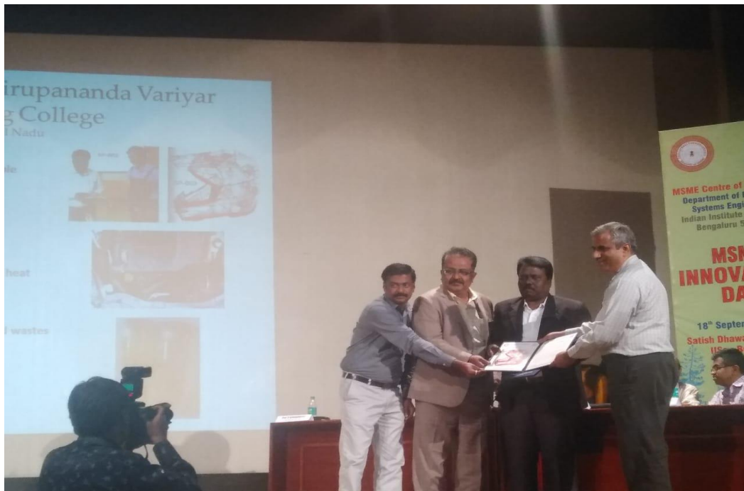
Award Received from IISc-MSME Bengaluru for Project Completion