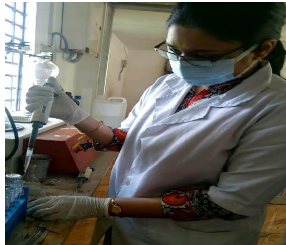
Students undergoing hands on training in GRD Bio Clinical Research, Namakkal