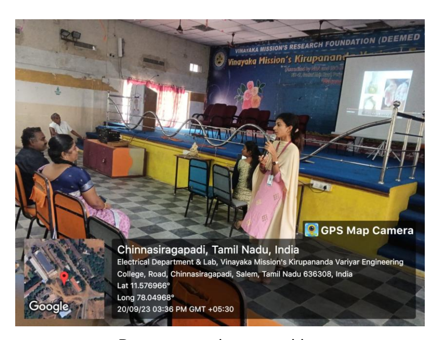
Paper presentation competition