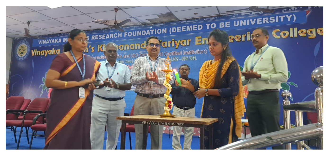
Lighting of Kuthuvilakku by the dignitaries