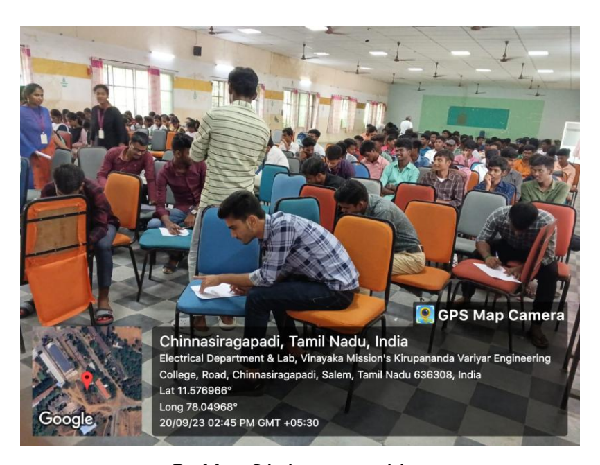
Problem Listing competition