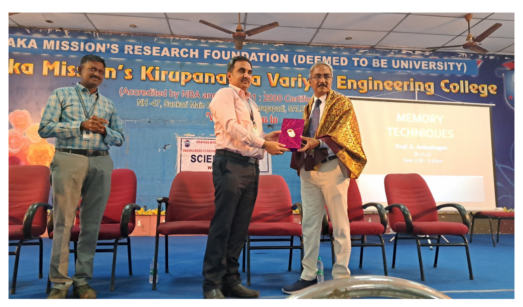
Honoring the Chief-Guest