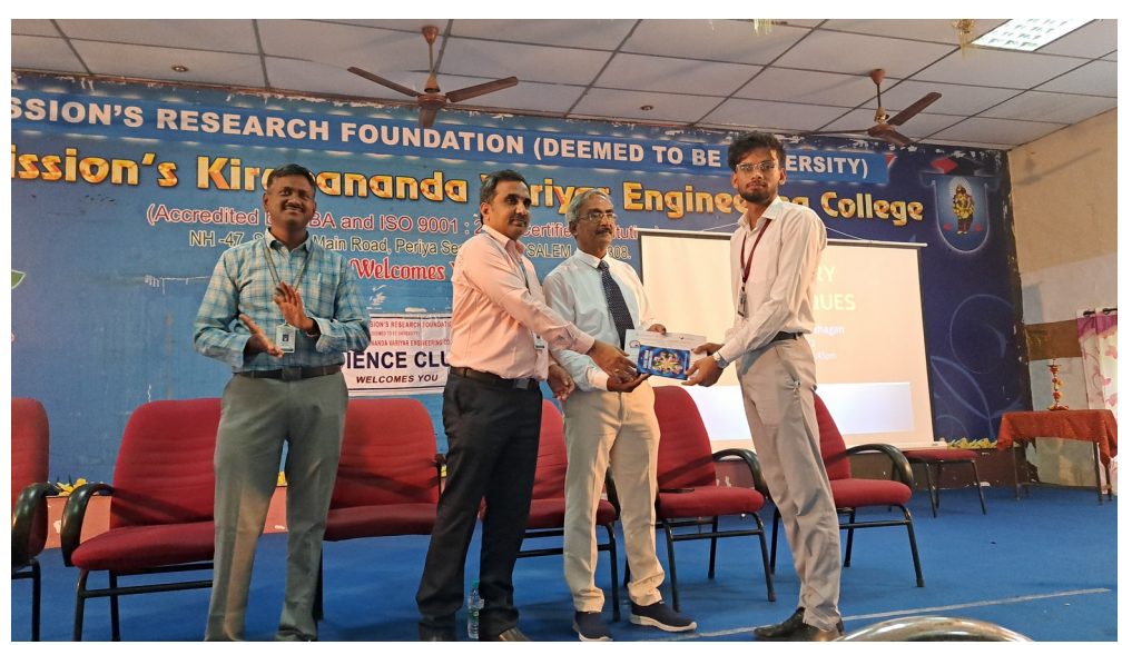
Prize distribution to the winner of science club competition